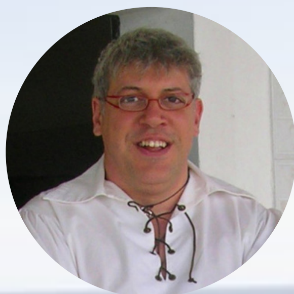
Pr. Marco Sangermano Photopolymer - Turin